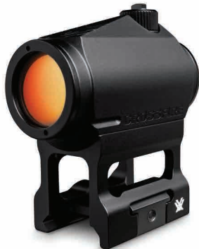
High Mount / Lower 1/3 Co-Witness