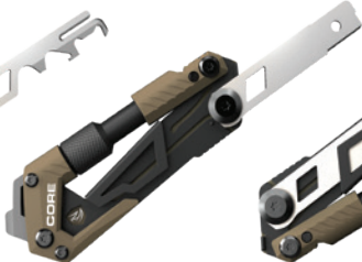
CARRIER & FIRING PIN SCRAPERS