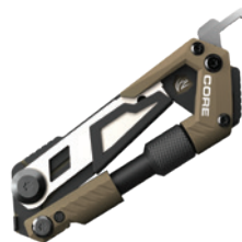
BOLT OVERRIDE & SCOPE TURRET ADJUSTER