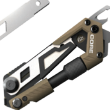
CORD CUTTER & BOTTLE OPENER