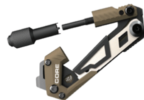
TAKEDOWN PUNCH & A2 FRONT SIGHT ADJUSTER

⚠ WARNING: This product can expose you to chemicals including Lead, which is known to the state of California to cause cancer and birth defects or reproductive harm. For more information, go to www.P65Warnings.ca.gov .