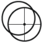
2nd focal plane