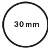
Main tube 30 mm